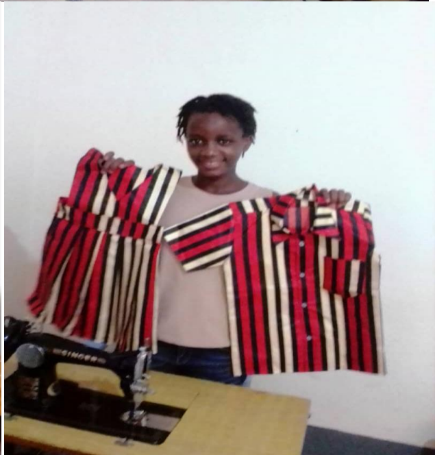
Tailoring trainee displaying their materials after the test.